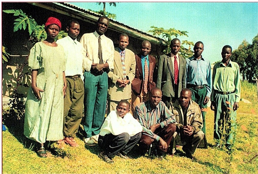
SOME OF THE MEMBERS OF THE KENYA BRANCH 2003