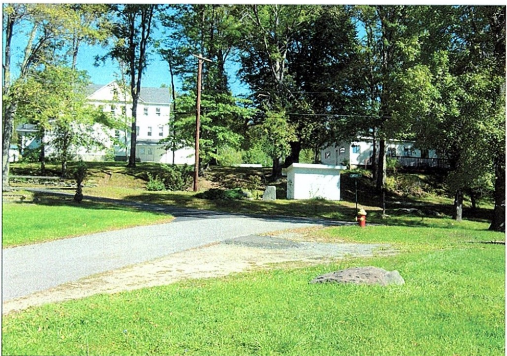
MT. CARMEL CENTER ENTRANCE