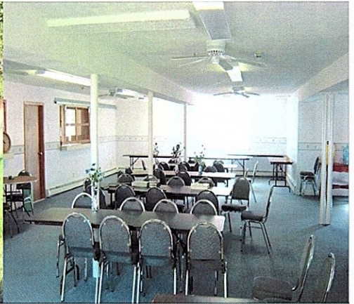
INSIDE THE DINING ROOM