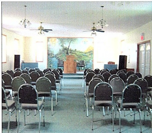
INSIDE THE CHAPEL