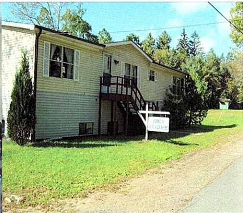
THE HEALTH CENTER