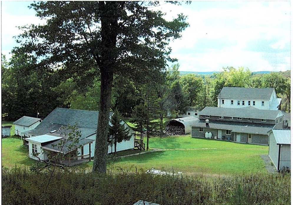
LAUNDRY (FAR LEFT) FOUR-UNIT APARTMENTS (LEFT) BACK OF DINING ROOM (CENTER) APARTMENTS AND DORMS (ABOVE)