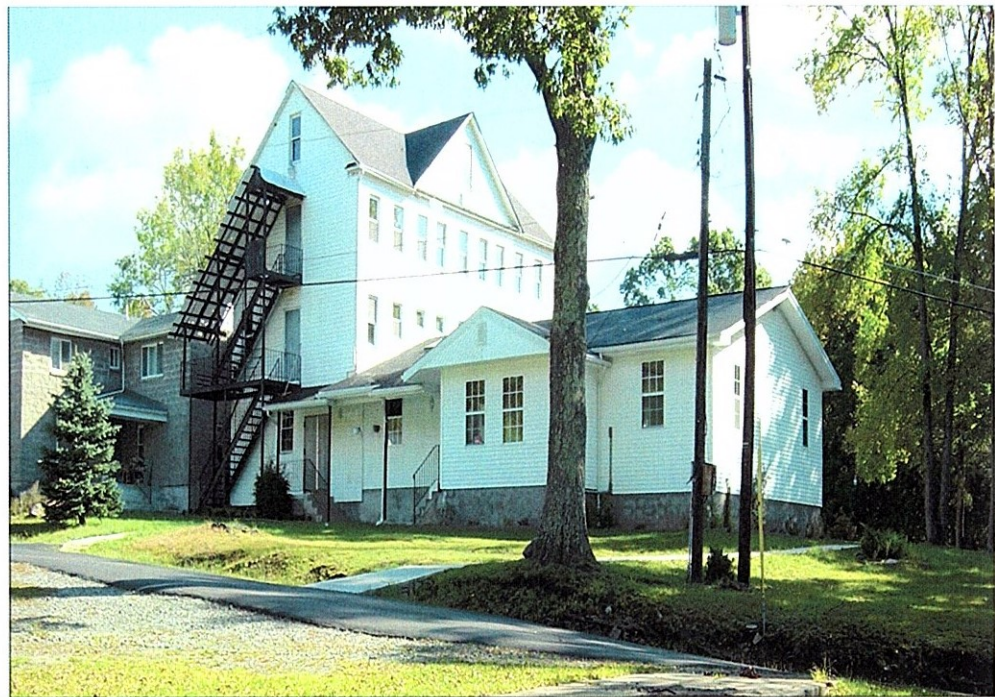
DINING ROOM (LEFT) APARTMENTS (ABOVE) CHAPEL (CENTER RIGHT) DORMS (ABOVE)